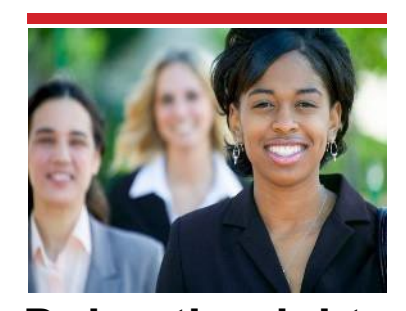
Doing the right thing is important

Managers, Legal Counsel, HR and Compliance officers are available to advise, guide and answer questions. The Code is absolutely essential to how we achieve success and places our values at the heart of every decision we make.